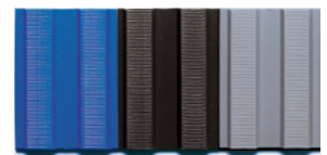
blue black grey

Material: 100 % PVC Hardness 80 Shore A +/- 5