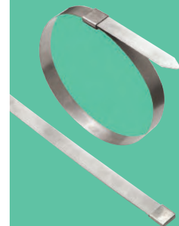
BAND-FAST™ Open End with Center Punch Clip

*BAND-IT reserves the right to substitute material with equal or better corrosion resistance and/or mechanical specifications.