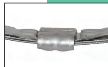
BAND-IT Jr.® Smooth ID Preformed Clamp

Center Punch - Used in less demanding applications where minimizing leaks and longevity are not critical.