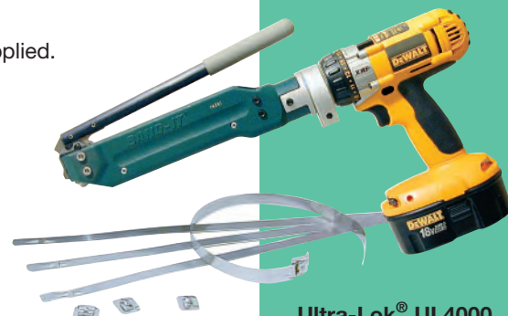
Ultra-Lok® UL4000 Rechargeable Electric Tool

† For 1/2" Applications, must use M09387 1/2" Shear Plate.