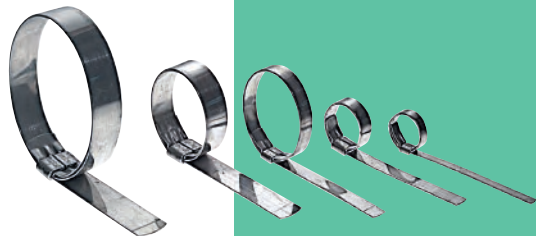
BAND-IT Jr.® Smooth ID Preformed Clamps