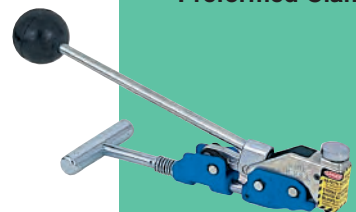
T30069 Center Punch Tool