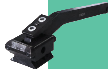
M16098 Junior® Head