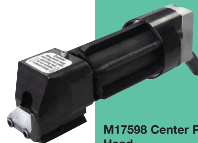
M17598 Center Punch Head