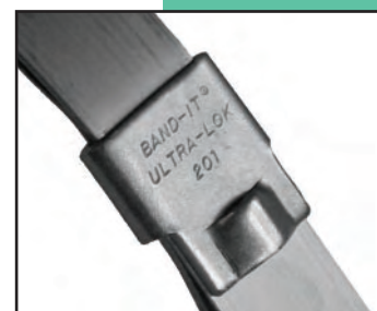
Ultra-Lok® Preformed Clamp

BAND-IT Jr® Smooth ID - Widest choice of sizes and materials in a leak resistant design. Our most popular clamp!