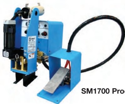
SM1700 Production Tool