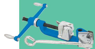
C00269 Junior® Hand Tool