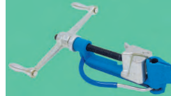
C00169 BAND-IT® Tool

*BAND-IT reserves the right to substitute material with equal or better corrosion resistance and/or mechanical specifications.