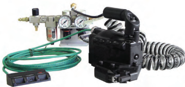
IT Series Tool

*BAND-IT reserves the right to substitute material with equal or better corrosion resistance and/or mechanical specifications.