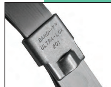
Ultra-Lok® Preformed Clamp

**1/2" bands require M09387 for UL4000 or UL9010 tools Also available in Ultra-Lok® Band see page 10