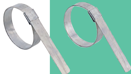
Center Punch Preformed Clamps