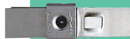
Universal Preformed Clamp