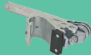
J05069 Junior® Heavy Duty Adaptor