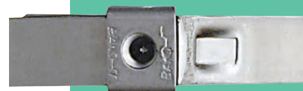
Universal Preformed Clamp