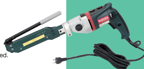
Ultra-Lok® UL9010 Electric Tool