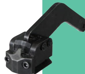
M18098 Ultra-Lok® Head