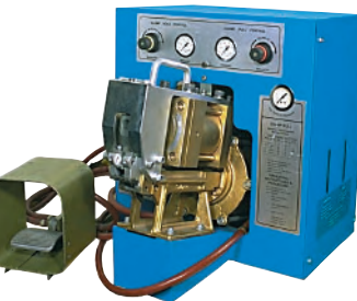
S35099 Automatic Air Tool

Junior® Non-Smooth ID Clamps are available, however BAND-IT recommends using the BAND-IT Jr.® Smooth ID Clamp in place of the Junior® Non-Smooth ID Clamps.