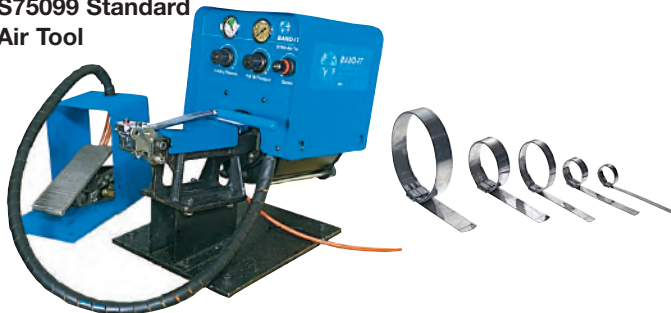
S75099 Standard Air Tool