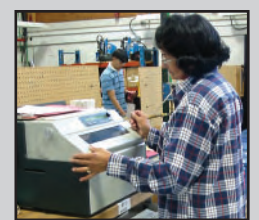
Custom Embossing Factory Service