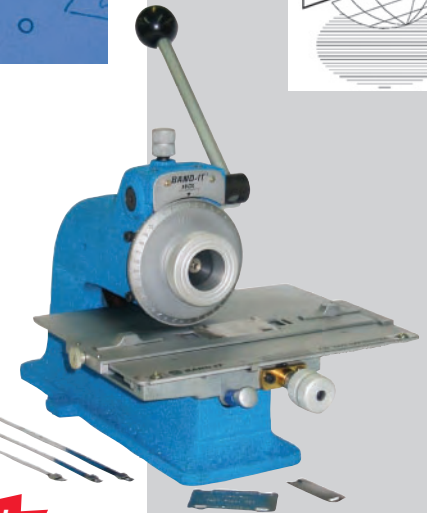
ID Tag Imprinter Tool

Print your own tags on 304 or 316 stainless steel and apply with Tie-Lok® Ties. Tag imprinter is available with a choice of character sizes. Imprinter with character wheel weighs 29.5 lbs. (13.4kg).