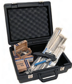
ID Kit ID3009