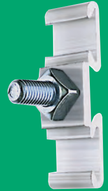
D51089 Mounting Plate