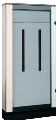
6025 02 with glass door 6026 51